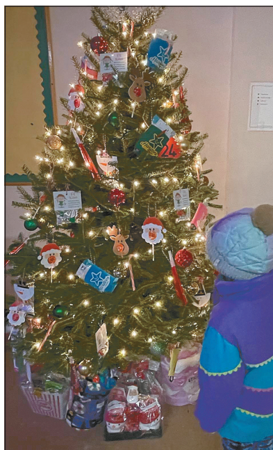
A child stares in awe at all the candy, treats, and Christmas ornaments on a tree decorated with children in mind.