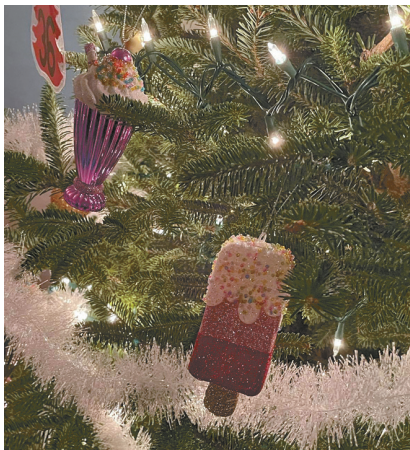
One tree was decorated with ice-cream novelties, malts, and other sparkling delights.

MERRILL MONUMENT CO. N282 County Hwy. K., Merrill, WI • 715-536-6654