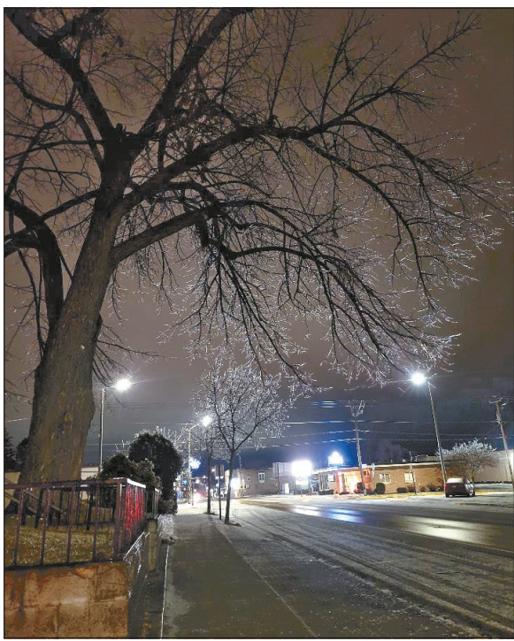
Before all the snow came freezing rain and ice, and the glimmer of all that ice on the branches of a tree, backlit by street lights, made for a beautiful sight. See more photos on page 8.