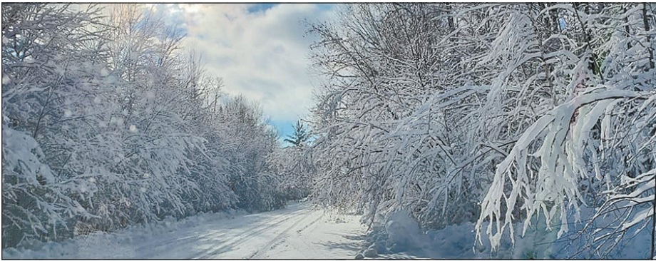
The clouds part, blue sky peeks through, and the sun shines down on a winter scene, where branches bend beneath the weight of the wet, heavy snow along a Lincoln County road.