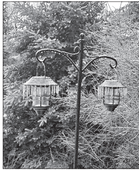
Covered with glistening ice, everything has a more nostalgic, magical appearance.