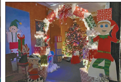
From Santa's main workshop area, visitors enter into the O'Tannenbaum Tour under this arch, where they are greeted by an array of lights and sparkling decorations and this year, 114 different items being raffled off to raise funds for 4-H and other area programs for youth, including 23 fully decorated Christmas trees.