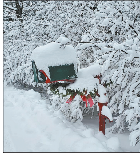
Inches of fresh snow are piled up on a mailbox trimmed for the holidays with evergreen boughs and ribbons, and who better to notice the beauty of nature's simple white adornments than the mail carrier who snapped this photo?