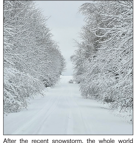
After the recent snowstorm, the whole world seems made up of variations in white ... this country road and the overcast sky, the trees and their branches on either side ... all beckoning to journey a little further down this narrow lane dressed in winter white.