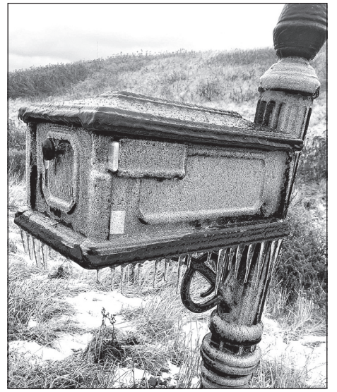
Frost and ice cover this mailbox in the countryside, giving it an old world charm.