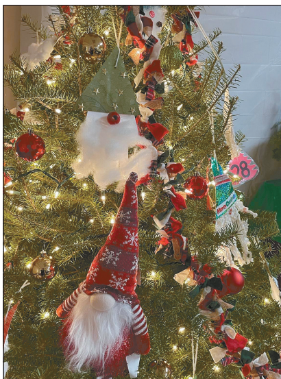
Gnomes are a popular Christmas theme this year. This tree was donated with a gnome theme and included a variety of different gnome ornaments of different sizes and kinds.