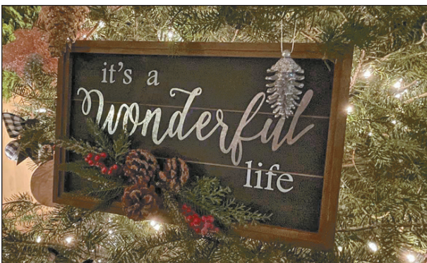
Some decorated trees even had delightful home decor like this sign tucked into the branches, and one lucky winner got to take home the entire tree-ornaments, lights, tree stand, tree skirt, decor, and all!