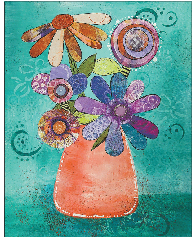
Flower Explosion, 11x14, mixed media. Acrylic, gel prints, buttons and fibers by Lisa Krueger, Oak View Studio, Tomahawk. Submitted photo.