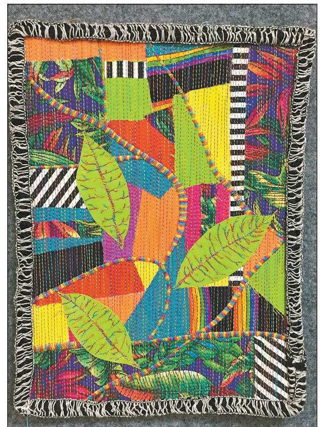
One of the textile art pieces Louise Schotz has created in her Outback Studio.