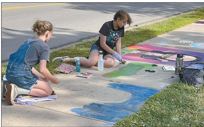
Young artists at work at Chalk It Up!