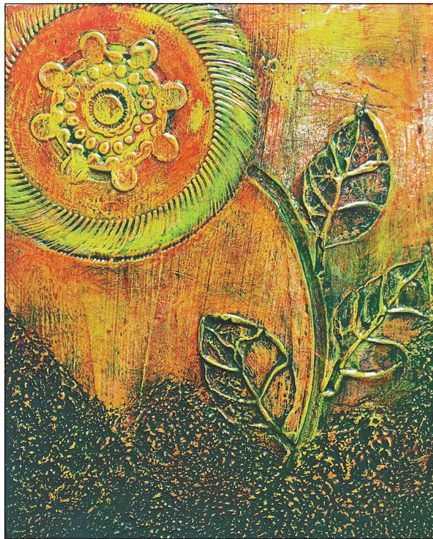
Artwork by Louise Schotz, Outback Studio, Irma.

Tour information and features about artists can also be found on Facebook. Search for North Woods Art Tours.