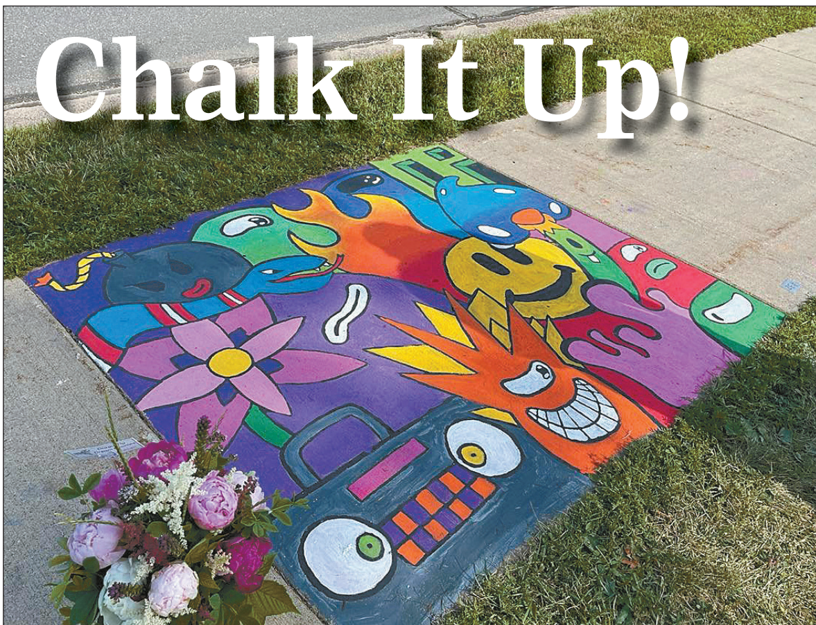
One of the finished art pieces at Chalk It Up! at Normal Park.