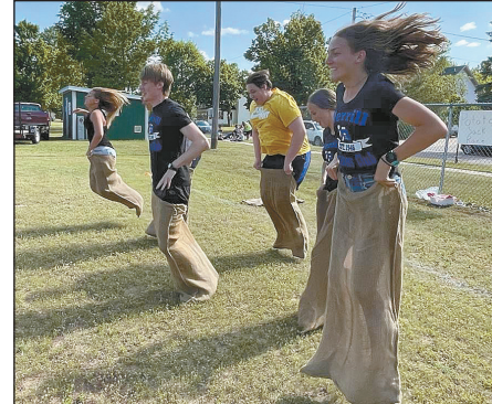
Students with the Merrill High School Business Club helped organize fun events at Normal Park like these sack races as part of the Chalk It Up! event.