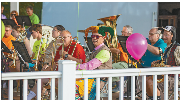
Many members of the Merrill City Band donned hats to add to the festivities at the concert on Wednesday, July 13, 2022, in conjunction with the Chalk It Up! event.