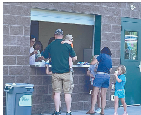
The concession stands were open early for Chalk It Up! and in preparation for the band concert later that evening.