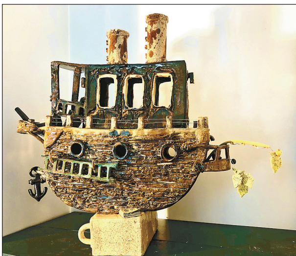
Boat Sculpture, stoneware by Jillayne Waite, the Waite studio, Arbor Vitae. Submitted photo.