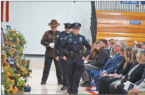
Uniformed Merrill Police Officers process in, two-by-two, to pay their last respects to their brother in blue.