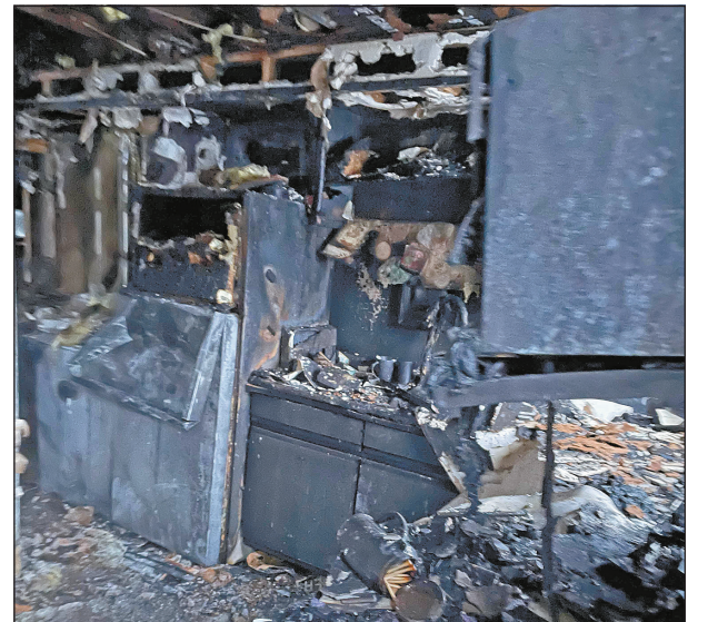
The interior of the lower apartment in one of the rental units at the Blue Haven Stables property is completely destroyed in a Jan. 13, 2022, fire.