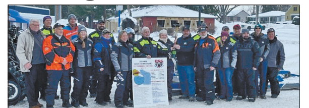
The Merrill Area Chamber of Commerce came out to greet the Badger State Games Torch Tour on its stop at DuWayne Kreager Insurance in Merrill on Jan. 13, 2022.