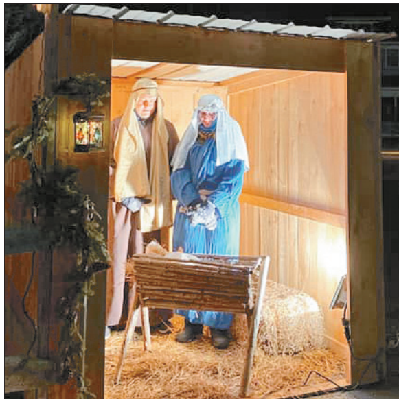
Trinity's Outdoor Living Nativity story culminates in the birth of Jesus, the reason for the season. Submitted photo.