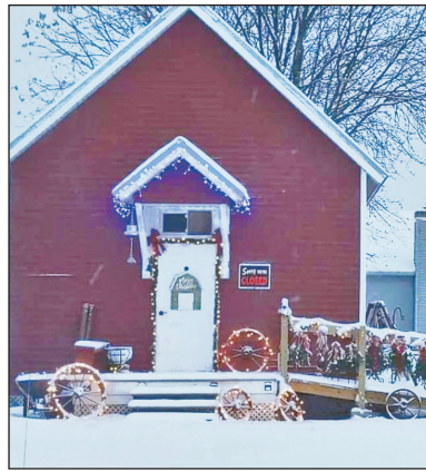
School House Unique is a quaint, one-of-a-kind shop housed in a former schoolhouse, located at N721 Range Line Rd., Merrill.

Regardless of what you're shopping for, great small businesses