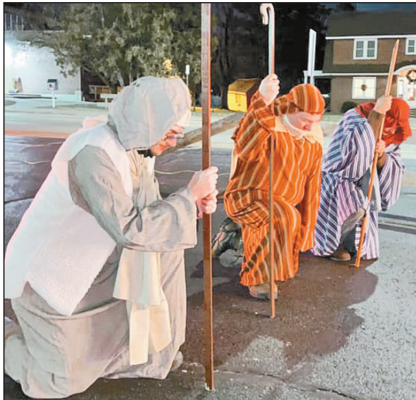
The shepherds journey to find the newborn King and pay homage to Him on bended knee, as part of Trinity's Living Nativity experience.

In addition, Trinity's Dorcas Group will hold a bake sale downstairs in the church, along with a few crafts, beginning at 3:00 p.m. until items are gone.