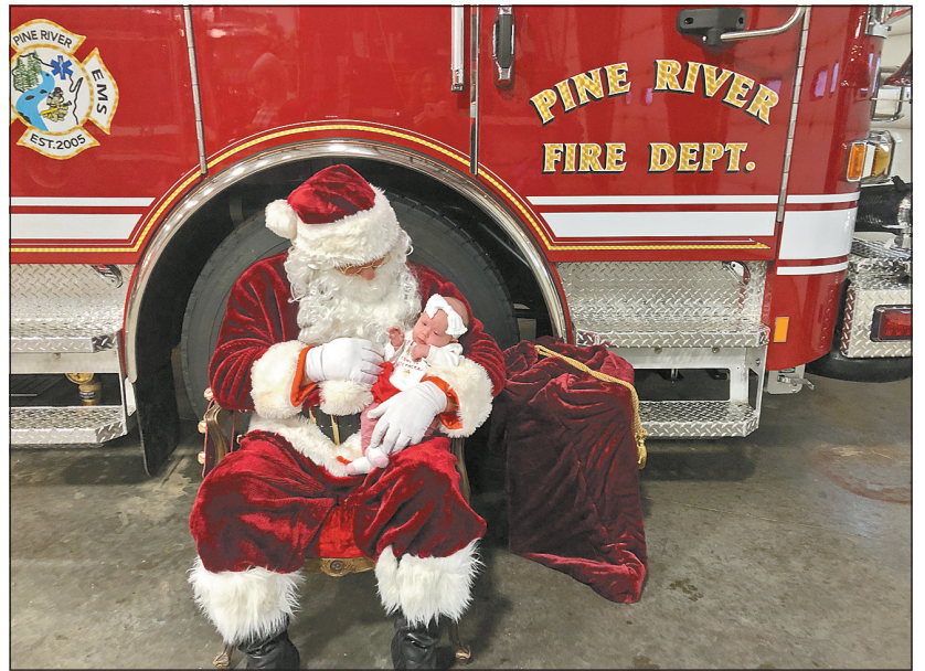
Pine River Fire Department's "Santa in the Fire House 2021" will include opportunities for kids to tell Santa their Christmas wishes, and for area businesses to market their businesses in the swag bags to be handed out. Parents are free to take photos.