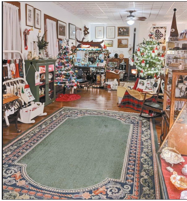
One view of the interior of School House Unique, all decked out for the holidays, showcases a few of the unique items for sale in the shop, from antique and vintage pieces to rustic items and handcrafted decor, plus much more.

Whether it's a gift for the holidays, a gift for yourself, or to set the scene for the holidays, if you're looking for high quality furniture and accessories, two local small businesses carry a huge selection: Courtside Furniture, 1022 E. Main St., and Miller's Furniture, 120 N. Prospect St., both in Merrill. From beds to dining room sets, coffee tables to couches, recliners and rockers, and decor to make it all feel like home, it's here and available locally.