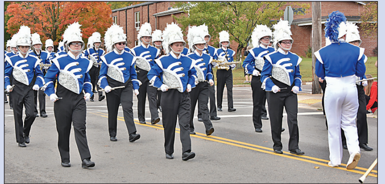
Above: The Merrill High School Band plays and marches in the Merrill Homecoming Parade on Saturday, Oct. 2.

Class of 2023 Junior Girls 42 - Class of 2022 Senior Girls 0