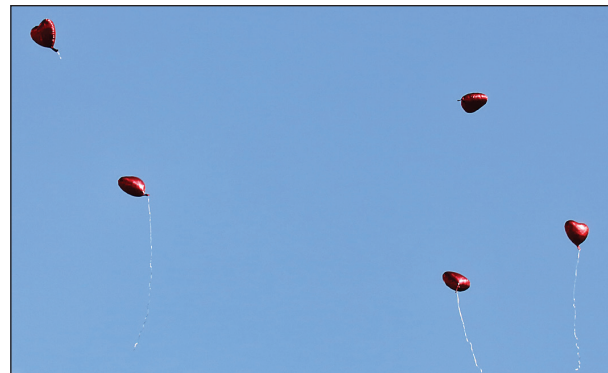
Following a prayer at half-time, some friends and family released red balloons in memory of Owen Cordova.

Brian Ball blew it open for Merrill with an 80-yard scamper to the endzone early on. The Thunderbirds battled back and tied it up late in the game 12-12."