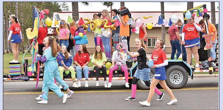
Class floats were one of the highlights of the Homecoming Parade.