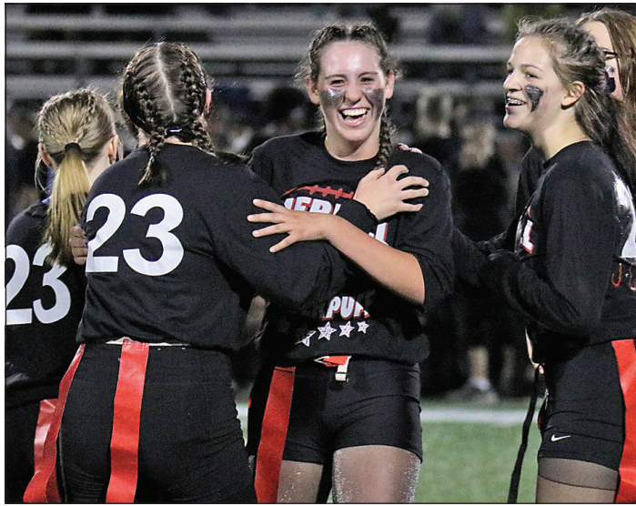
The Junior girls had a great game at Wednesday's Powder Puff against the Senior girls.

"Meeting on the hallowed field of Bluejay Stadium, the Merrill High School Juniors were lucky to escape with a victory at the hands of a far superior Senior women's football team, 42-0. While the Senior girls allowed the Junior team to narrowly win the game, the graduating class of 2022 will be remembered for their athleticism and academic aptitude. Clearly, the vast majority of the fans in attendance were cheering for a Senior victory, and left disap-