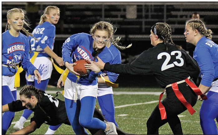
These girls are "all in" as the Seniors (blue) take on the Juniors (black) during Homecoming Powder Puff 2021.

pointed and saddened by the loss. The good people of the Merrill community deserved a Senior victory and are welcome to express their frustration and general discontent to the Junior coaching staff."