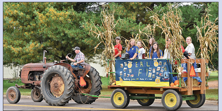
The Merrill Future Farmers of America (FFA) has a float in the Homecoming Parade.