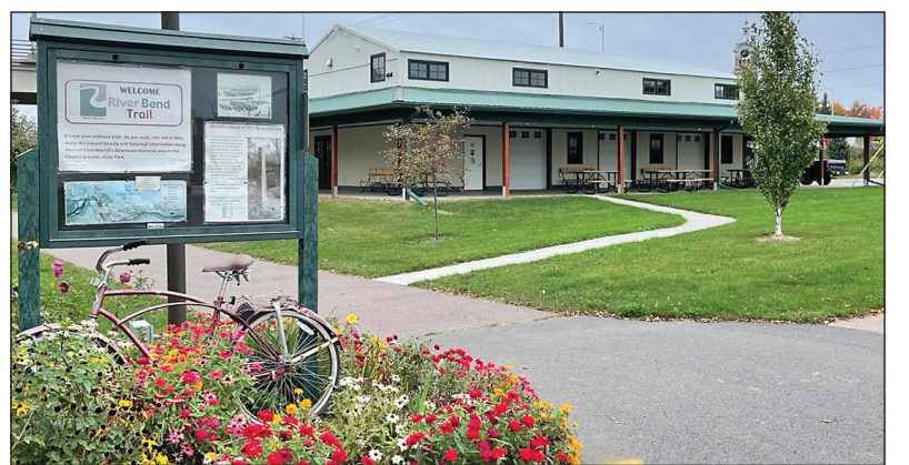
The River Bend Trail continues to develop and grow, a continuing work in progress that began as a dream with the creation of the River District Development Foundation 10 years ago, then joined by the Friends of the River Bend Trail, and countless volunteers and donors. A 10th Anniversary celebration will kick off at the Agra Pavilion on Oct. 13.