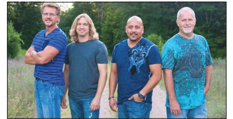
See CONCERT page 5 Living River Quartet.

Trinity Lutheran Church in Merrill is sponsoring the Living River Quartet in concert at the Normal Park Gazebo on Friday, Sept. 10, at 6:00 p.m. This is the fifth year the church has sponsored a