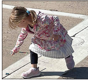
What's a parade without candy? One little girl runs out to get a few pieces after she overcame her initial shyness.