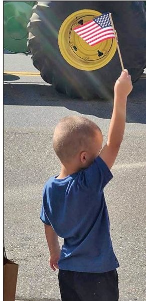
One young man waves an American flag as he watches the parade go by.