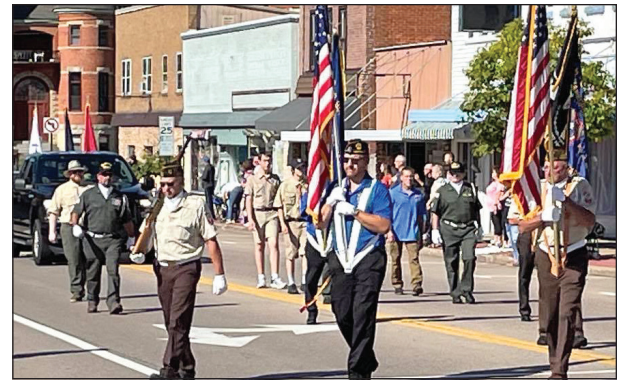
The American and Wisconsin state flags were at the front of Merrill's Annual Labor Day Parade on Monday, followed by representatives of the VFW, American Legion, DAV, Ladies Auxiliary, and Mar-Lin post, along with the Boy Scouts.

The bright sunny weather with blue skies, mild temperatures, and a light breeze provided the perfect backdrop for this year's parade.