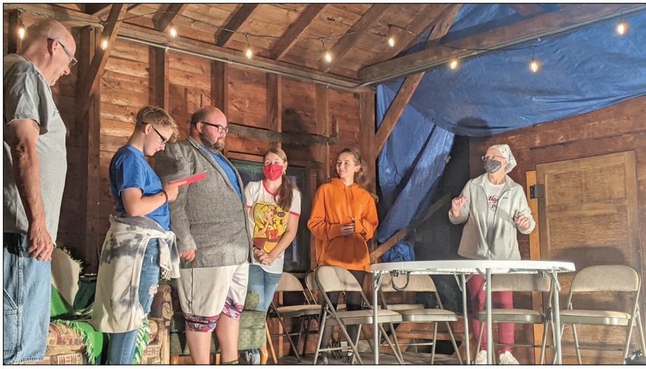
Actors ran through their lines at a rehearsal for Over the River and Through the Woods , in preparation for their performances.