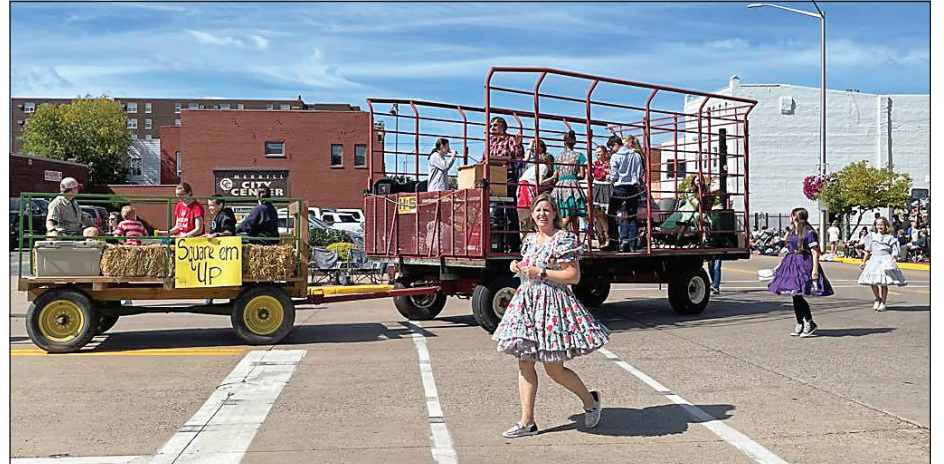
"Square 'Em Up" square dancers twirled and danced on their tractor-drawn wagon, while other dancers flanked the wagon and worked the crowd.