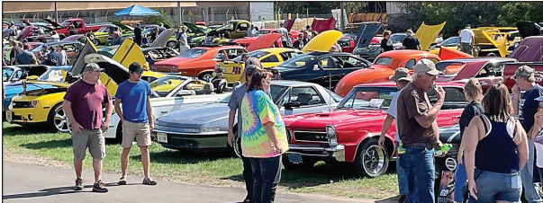
A colorful sea of automobiles drew car enthusiasts to Merrill on Labor Day.