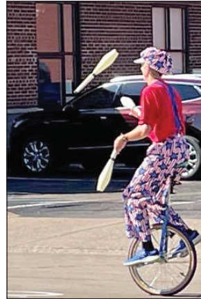
Young and old alike are impressed by an area man who can both juggle and ride a unicycle ... and at the same time!