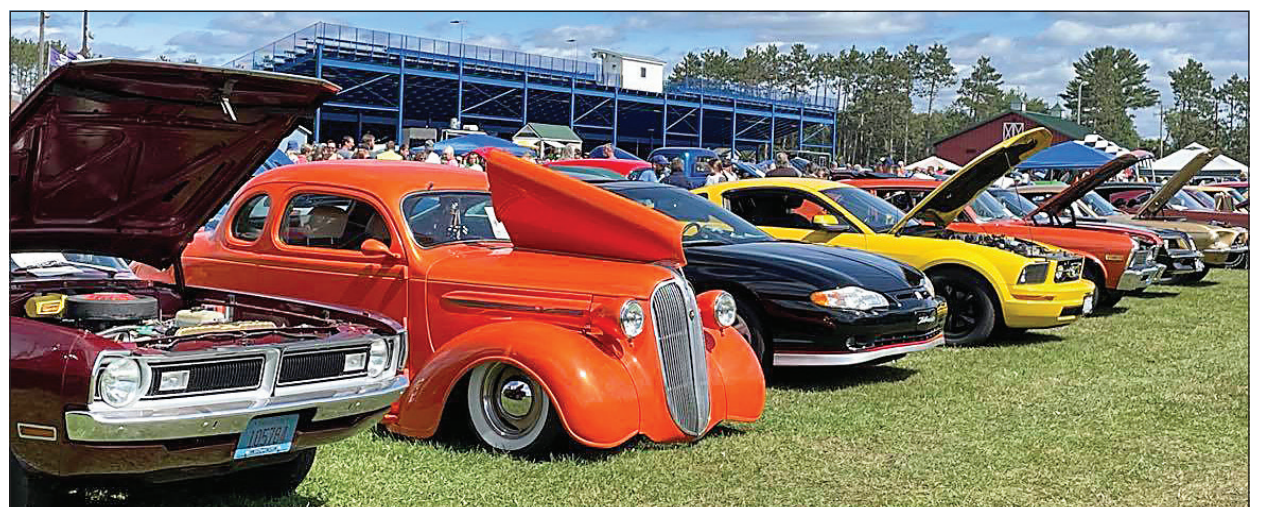
A wide variety of vehicles were available for viewing at Merrill's Labor Day Car Show at the Merrill Festival Grounds.