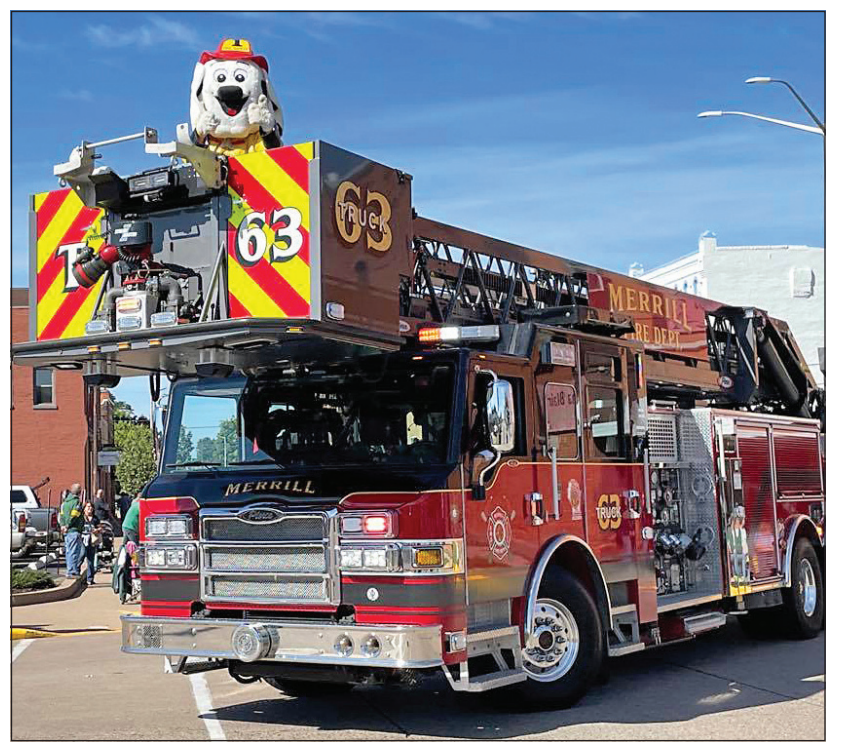
The Fire Pup rode along atop Merrill Fire Department's Fire Engine 63 for the parade, to the delight of the children.

The little ones were armed with See PARADE page 4