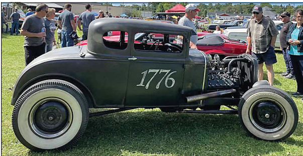
Admirers gathered around vehicles to check out all of their features at the Labor Day Car Show in Merrill.

Individuals, couples, and families came down to check out the vehicles and enjoy food from the local food stands - cheese curds and cheeseburgers, lemonade, French fries, and more - as well, a wonderful return to an annual end-of-summer ritual before settling into the routines of the school year and the autumn soon to come.