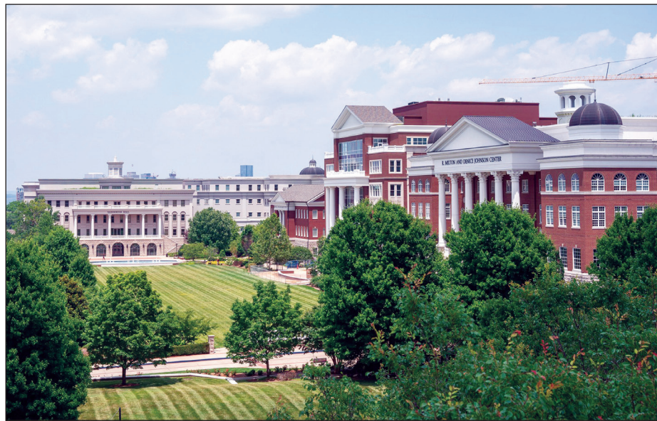
The main campus buildings of Belmont University in Nashville, Tennessee, June 27, 2023.