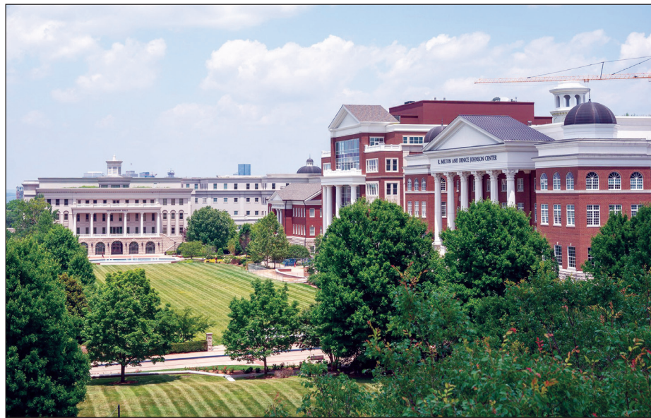
Lawn shot for Admissions at Belmont University in Nashville, Tennessee, June 27, 2023.