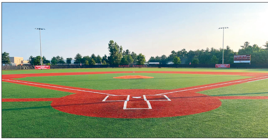
The Wisconsin Rapids Redhawks play their home games at the Rapids Area Sports Complex.