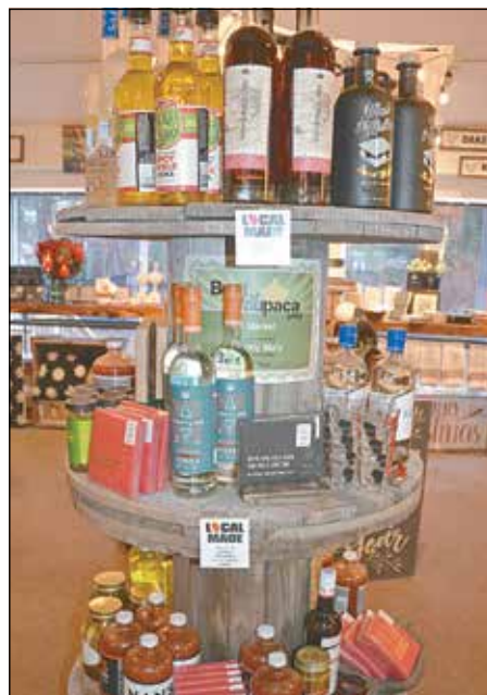
The Bloody Mary tower at 81 Market in Waupaca has all of the fixings for making Bloody Marys. A Bloody Mary gift basket could easily be assembled here. Most of the products are made in Wisconsin.

There is a grilling section with tools, barbecue sauces and dry rubs. There are