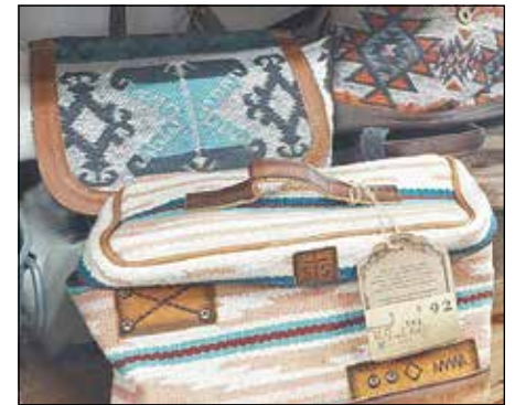
Western style bags are a hit at The Back Forty.

"Our family is so appreciative of all of the love and support we've received," she said. "We absolutely couldn't do it without you."