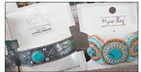
Turquoise bracelets from The Back Forty will add a little style to your outfit this holiday season.