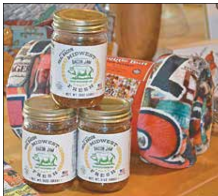
The ultimate stocking stuffer might be a jar of bacon jam. On the tongue, it feels like any other jelly but the taste buds are taken over with a savory bacon flavor.

The shop is located at N2728 on County Trunk QQ in King. The store is closed Monday, Tuesday and Wednesday and is open from 10 a.m. to 5 p.m. Thursday, Friday and Saturday. It is open from 10 a.m. to 3 p.m. on Sunday.