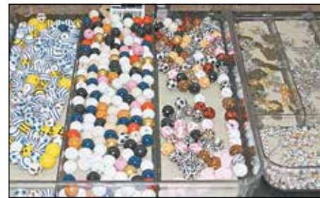
There are plenty of beads to choose from for the jewelry maker on you shopping list.

"That is what keeps our little towns alive," she said.