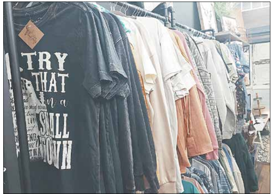
There is always a wide variety of clothing to choose from at The Back Forty in Scandinavia.

For the women on your list you can find boots, hats, handbags, jewelry and more.