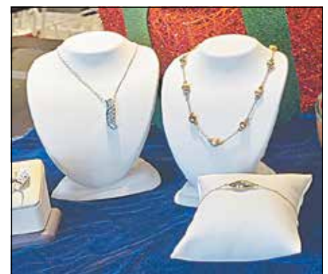
These necklaces are great for holiday gift giving.