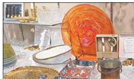
Glassware and serving dishes are also good for holiday gift giving.

Free gift wrapping and layaway are available.