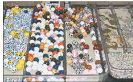
There are plenty of beads to choose from for the jewelry maker on you shopping list.

"That is what keeps our little towns alive," she said.