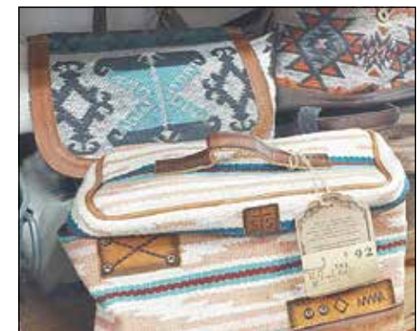
Western style bags are a hit at The Back Forty.

"Our family is so appreciative of all of the love and support we've received," she said. "We absolutely couldn't do it without you."