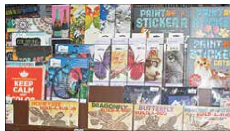
Whether you want to build a bug or paint by sticker there are many choices at Mouse's Art Supply and Studio.