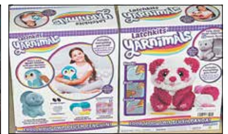
Latchkit Yarnimals from Mouse's Art Supply in Waupaca are fun to make.