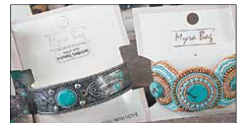
Turquoise bracelets from The Back Forty will add a little style to your outfit this holiday season.