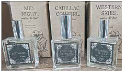
Left: Give the gift of fragrance for Christmas. Right: There is a wide variety of jewelry to choose at The Back Forty in Scandinavia.