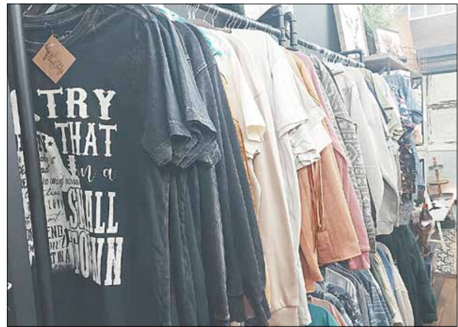
There is always a wide variety of clothing to choose from at The Back Forty in Scandinavia.

For the women on your list you can find boots, hats, handbags, jewelry and more.