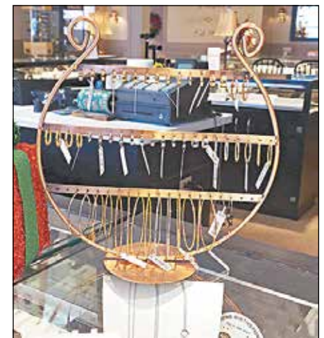
'Tis the season for holiday gift giving.