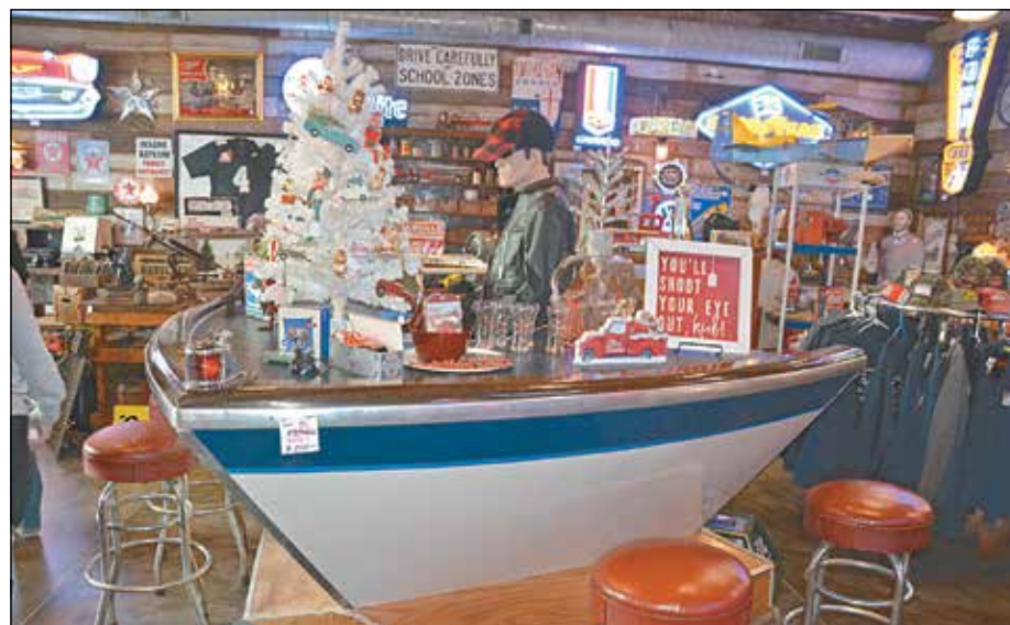
The focal point in the new addition at Olde Country Store Antiques is the boat bar. A boat was cut in half and refitted as a bar. The new addition was opened in May.

The Olde Country Store holds lots of nostalgia and has a museum-like quality. Pinball machines are a high-ticket item but also the shop is loaded with inexpensive stocking stuffer items.