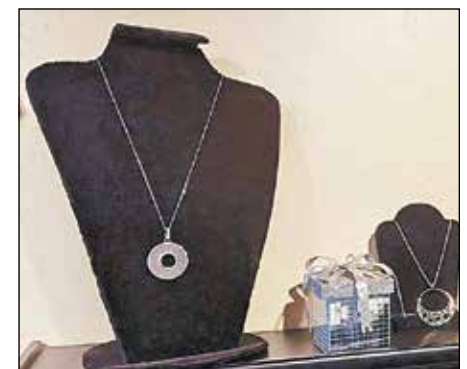
Necklaces are also good for gift giving for that special someone on your list.