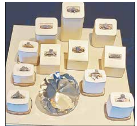
Diamonds are a girl's best friend at Christmas time.