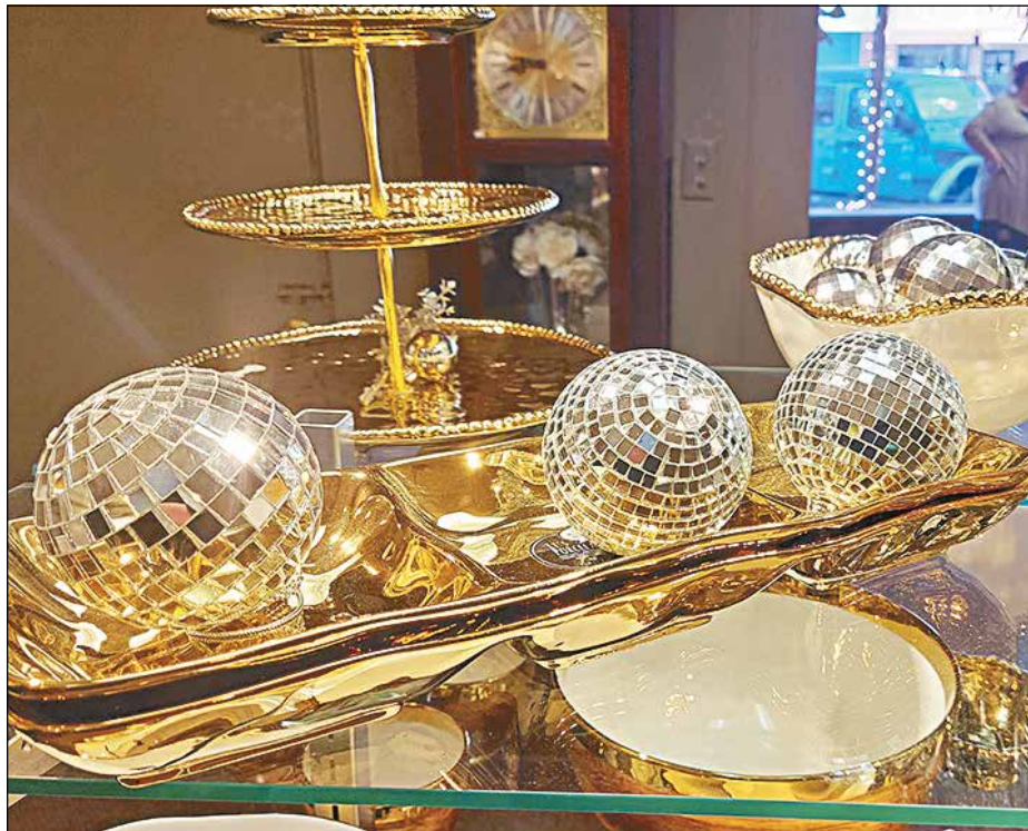
Spruce up your home for the holidays with some silver and gold decorative pieces for your dining room.