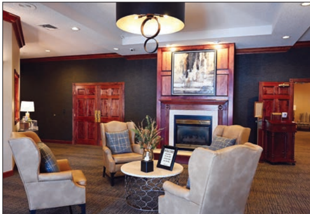
A.J. Holly and Sons Funeral Home offers comfortable, quiet space for families and friends to converse.

For more information on A.J. Holly and Sons Funeral home go to their website at www.hollyfuneralhome.com .