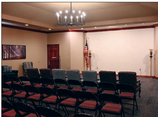
Space for services and memorials at A.J. Holly and Sons Funeral Home.