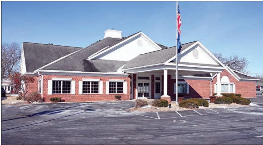
A.J. Holly and Sons Funeral Home is located at 526 S. Main St. in Waupaca.