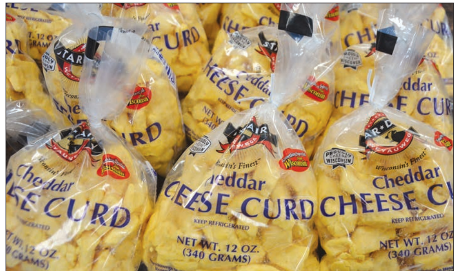
Cheese curds at Weyauwega Star Dairy.

The Weyauwega location is open from 8 a.m. to 6 p.m. Monday through Friday. On