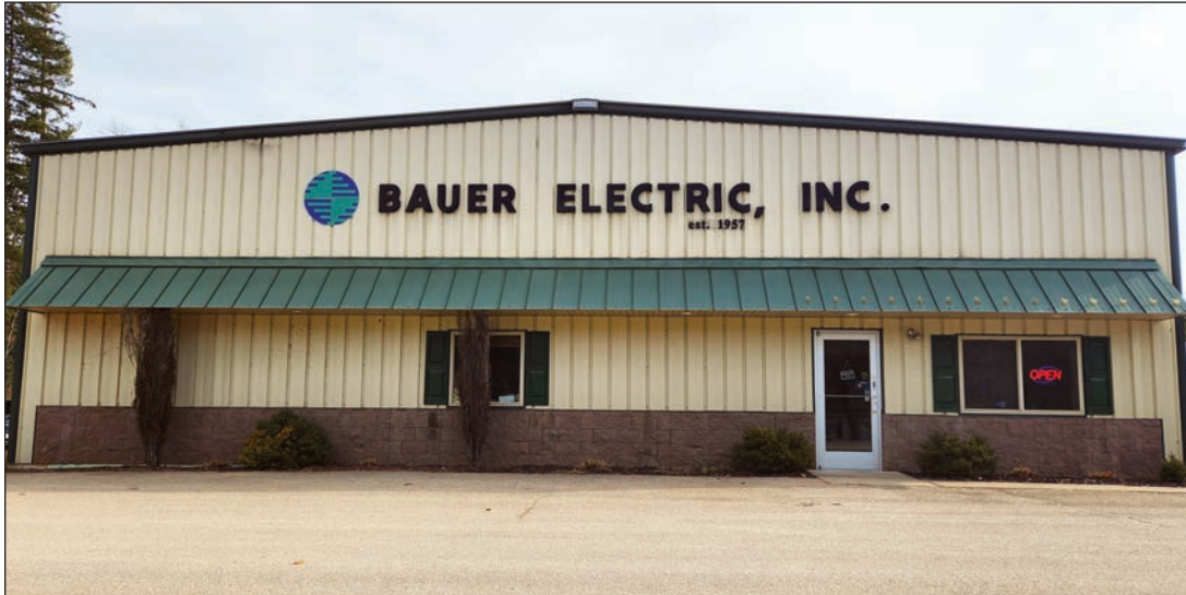
Bauer Electric is located at N2858 County Trunk QQ in Waupaca.