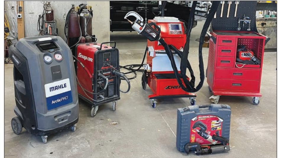
East Side Auto Body has made a major investment in keeping its tools and equipment up to date. Shown from left are a R1234YF air conditioning machine, aluminum/steel MIG welder, three-phase spot welder, aluminum dent pulling repair station and, in front, an aluminum self piercing riveter.

welder for spot welding, a R1234YF air conditioning machine, aluminum dent-pulling repair station and an aluminum piercing riveter. All of which will help them keep more work in-house and stay current with auto industry standards and trends.