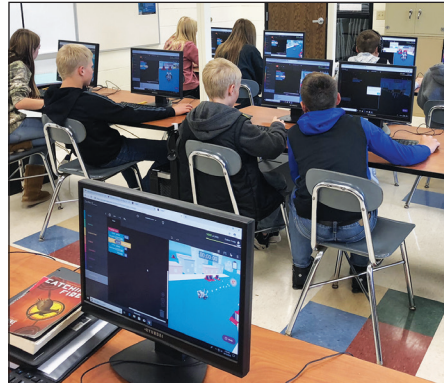
7th grade students during qualifying round CRCC competition.