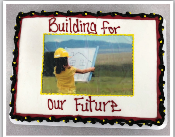
MANAWA RESIDENTS CELEBRATED the successful passage of two referenda with some snacks and fellowship during the Feb. 6 Gallery Walk at the Jr/ Sr. High School. Guests enjoyed visiting, getting an overview of School Perceptions Survey 2 & Gym Referendum, viewing plans of the districts expansion and having a question and answer time.