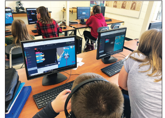
7th grade students during qualifying round CRCC competition.